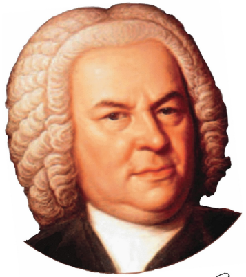
Johann Sebastian Bach.